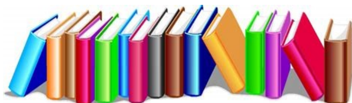
Library Lines September 2021